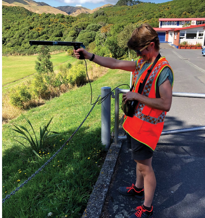
Using a receiver to pick up a specific radio frequency from a Wander Search pendant.