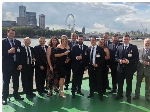
Representatives from Surf Life Saving Kariaotahi, Coastguard New Zealand and Auckland Westpac Rescue Helicopter in London to accept the awards.

Together, they saved a man, woman and child who had been thrown into the water when their boat capsized on the Port Waikato River Bar. The Police Eagle helicopter located the three people in darkness using infrared heat detection equipment. The Auckland Rescue Helicopter positioned overhead, but conditions forced it to abandon a winch