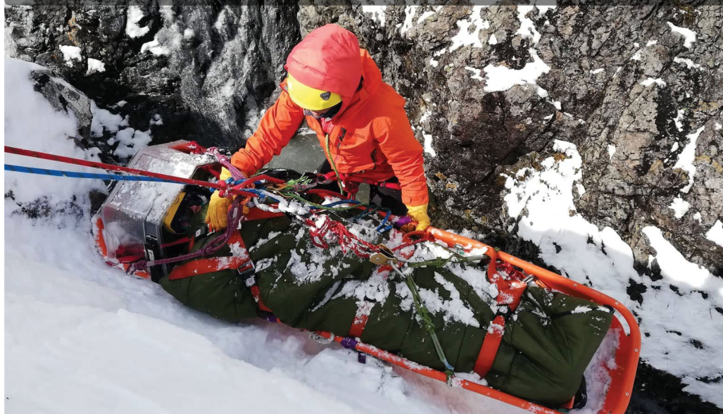
A JASART stretcher raise and lower exercise in practice.

"The technical skills we need in Antarctica are very similar to the skills we'd employ in a high alpine environment in New Zealand."